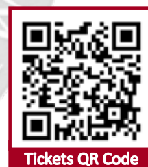
Tickets QR Code

RSVP By October 2, 2022. Tickets will NOT be sold at the door.