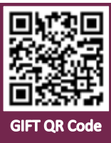
GIFT QR Code

All sponsors will be acknowledged in the program and at the event. The deadline to sponsor is September 18, 2022.