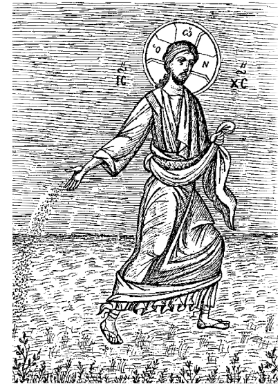
Christ the Sower