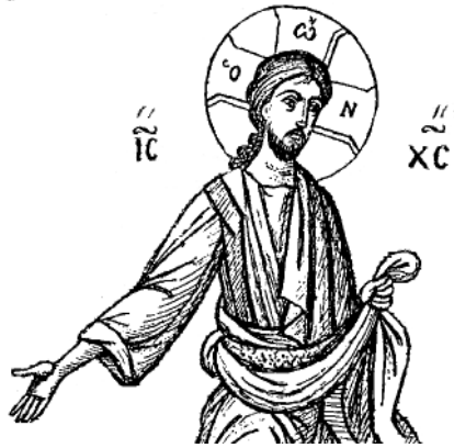
Christ the Sower sows the word of God