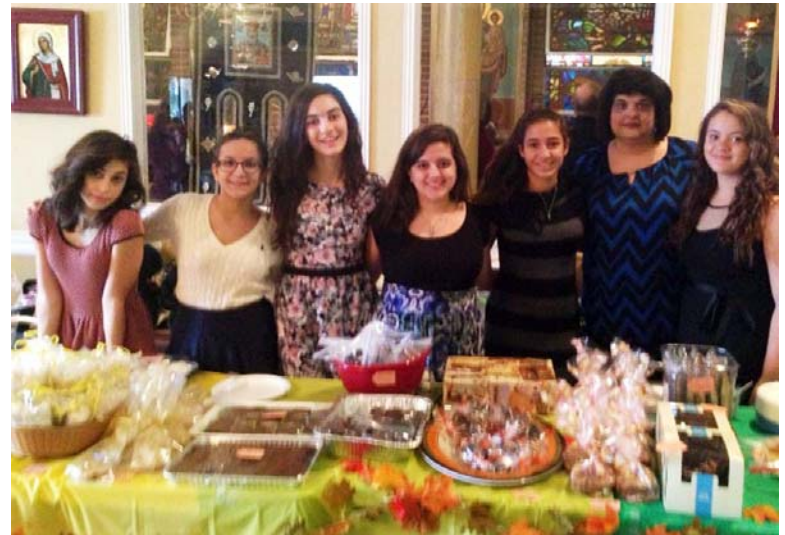
GOYANS hold bake sale to sponsor future youth enriching activities.