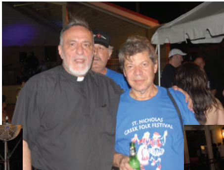
Thanks to our volunteers, the dancing groups and the weather on our side the festival was one of the best ever! Και του Χρόνου!