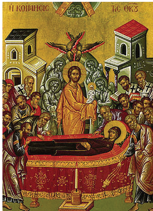
The Dormition of the Theotokos.

Because of this revelation, the apostles and the first Christians understood that they were to give special honor to the Virgin Mary and call on her in prayer for help.