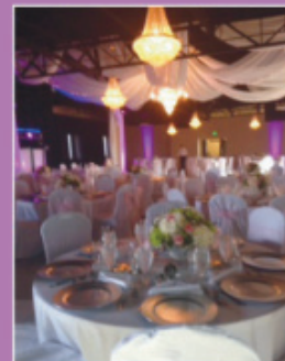
OUTDOOR VENUE WITH AMPHITHEATRE STAGE AND DANCE FLOOR FOR UP TO 1,500 GUESTS

701 QUAIL STREET BALTIMORE, MD 21224 • (410) 294-1253 • WWW.GREEKTOWNSQUARE.COM