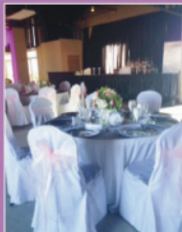
FIRST FLOOR HALL FOR UP TO 175 GUESTS

WEDDING RECEPTIONS • ANNIVERSARY CELEBRATIONS • BIRTHDAY PARTIES NEW YEAR'S EVE • COMPANY GATHERINGS • CLASS OR FAMILY REUNIONS RETIREMENT PARTIES • BUSINESS MEETINGS