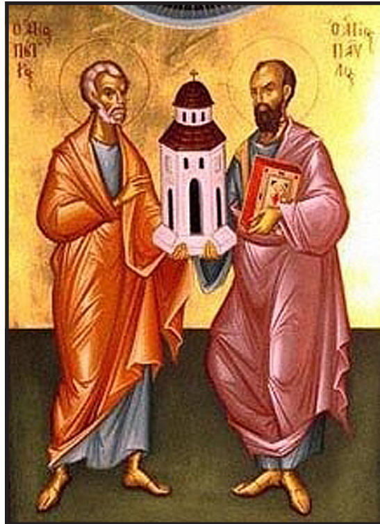
Apostles Peter and Paul holding the Church.