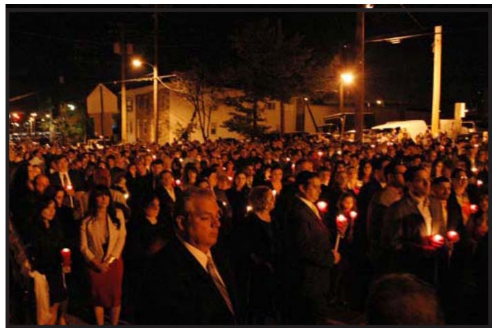
Parishioners sharing "the Light" in front of the church.