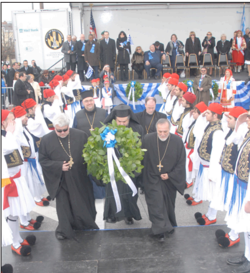
Parish young men dressed as evzones, Orthodox Clergy, the Parish Council and the Greek Afternoon School children of Saint Nicholas Church were among the groups from many Maryland areas that marched in the parade, March 24, making it again a successful yearly event.