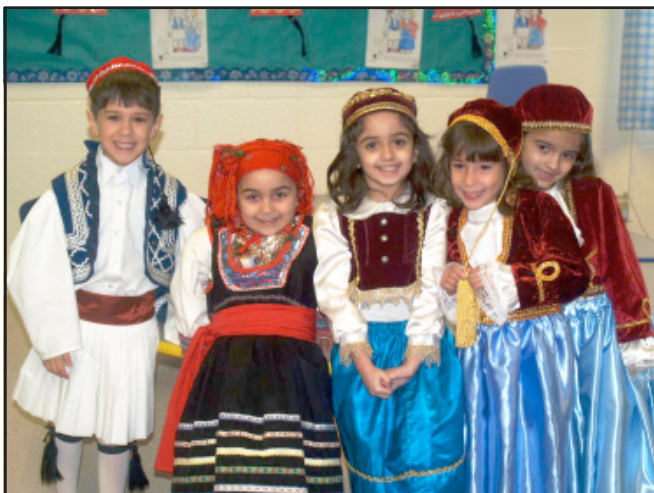
The Saint Nicholas Greek School kindergarten students anxiously waiting to perform their poems for the Greek Independence Day celebration.