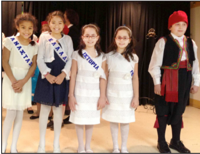
Saint Nicholas Greek School fourth graders performing at the 25th of March Celebration held on March 17, 2013.