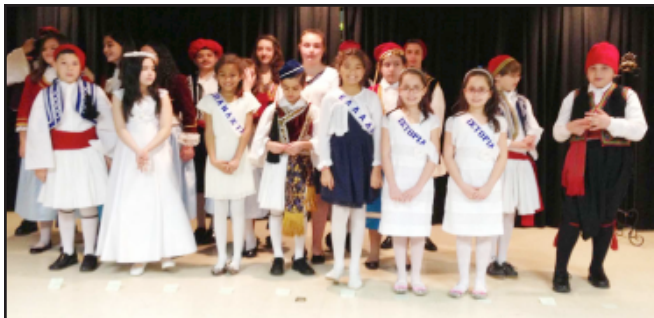
Greek School students commemorating the 25th of March celebration with songs and poems.