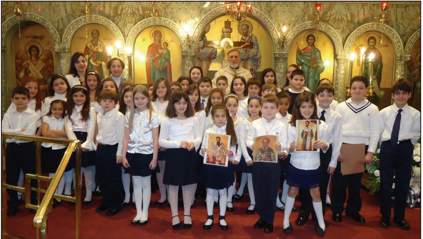
Greek School students performing at the Three Hierarchs Celebration at St. Nicholas Church.