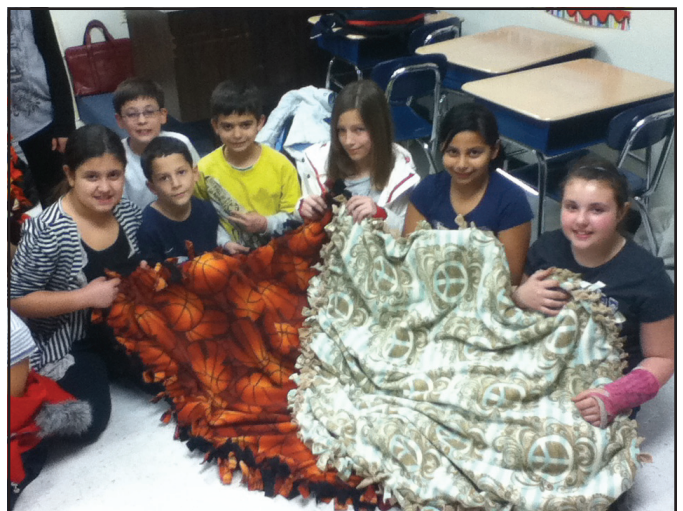
Greek School students made “Welcome Blankets” for the Ronald McDonald House.