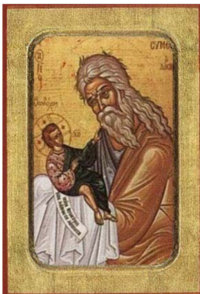
Saint Symeon holding Baby Jesus

tacular conversions...Matthew, the tax collector, Zaccheus the tax collector of Jericho, Mary the Harlot, and the